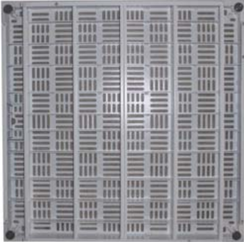
Bottom Panel View