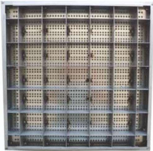
Bottom Panel View