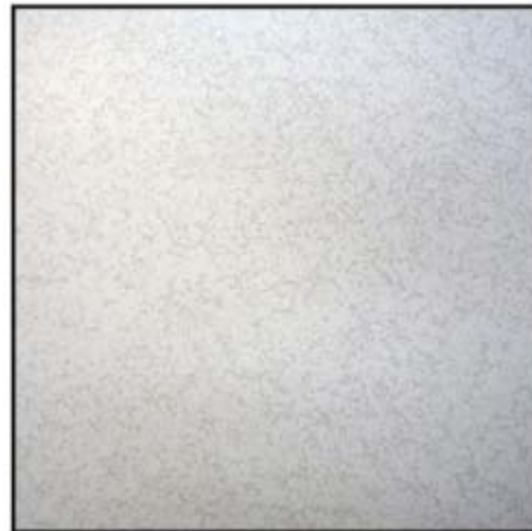
Top Panel View Industry Standard Gray Starlight Finish