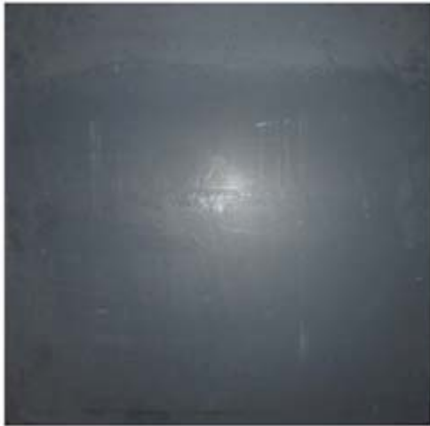
Bottom Panel View